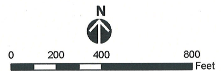
Figure 6. Lakeside Land Use for Lake Geneva, King County, Washington.